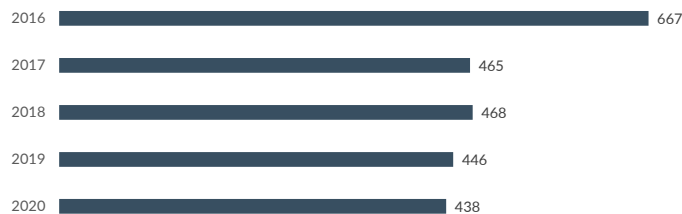
Annual Water Consumption, Million Gallons

In 2021, Carus furthered its water stewardship goals by participating in a Water Risk Assessment Pilot Program through the American Chemistry Council. This included oversight by a third-party expert from The Water Council to review our LaSalle water stewardship plan and expand our view of water conservation and management. In LaSalle, we are in a low to medium water risk area and we have minimal impact on the watershed.