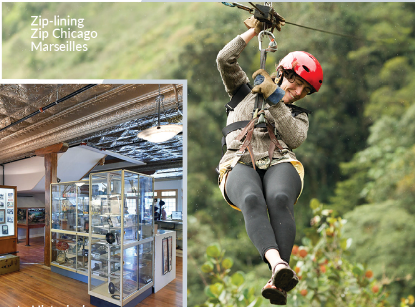
Zip-lining Zip Chicago Marseilles