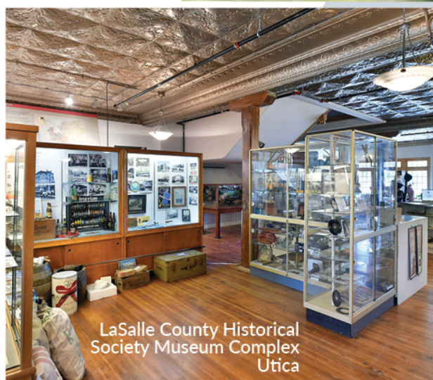
LaSalle County Historical Society Museum Complex Utica