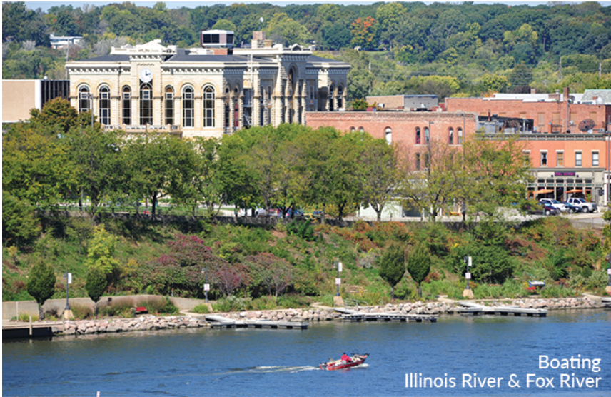
Boating Illinois River & Fox River

Discover a wealth of activities and attractions in Starved Rock Country, from serene canoe trips along scenic rivers to thrilling adventures like skydiving. This vibrant area is not only an ideal home but also a perfect destination to welcome friends and family.