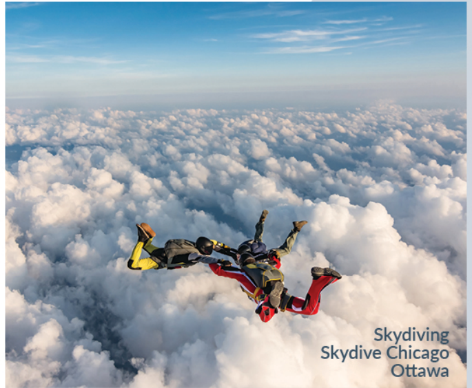
Skydiving Skydive Chicago Ottawa

There's something for everyone. Get ready to make memories that will last a lifetime. Choose your thrill and let the adventure begin.