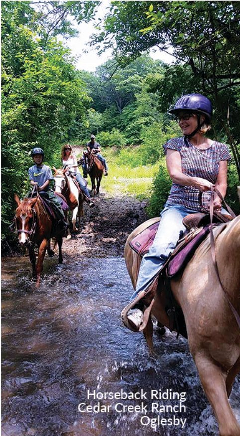
Horseback Riding Cedar Creek Ranch Oglesby