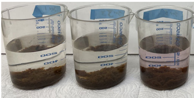
POLYPRO polymer and CARUSOL® Contaminant Reduction

Contact a member of our team to discuss our solutions: