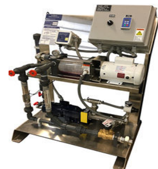
POLYPRO Feed Equipment

During its 100-year history Carus' ongoing emphasis on research and development, technical support, and customer service has enabled the company to become the world leader in permanganate, manganese, oxidation, and base-metal catalyst technologies.