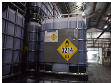
CARUSOL® Liquid Permanganate