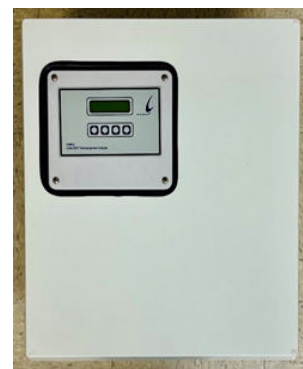
CARUTEST® Permanganate Analyzer