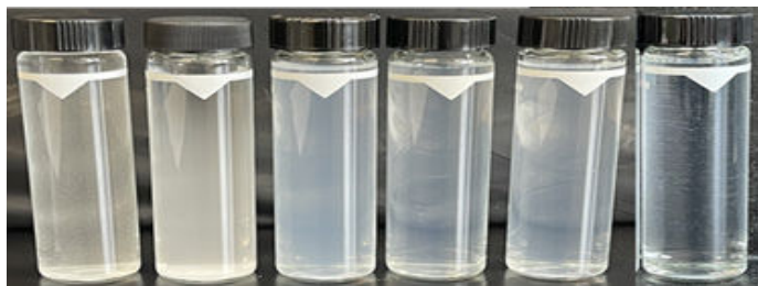
CARUSQUEST® 501 Scale Inhibition