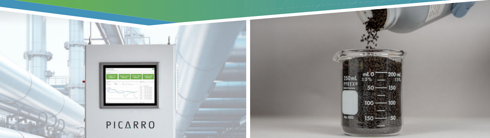
Figure 1. Picarro's EtO CEMS system and Carus' CARULITE® 500 Granules are proven effective solutions for EtO emissions monitoring and abatement.