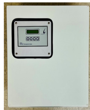
CARUTEST® Permanganate Analyzer