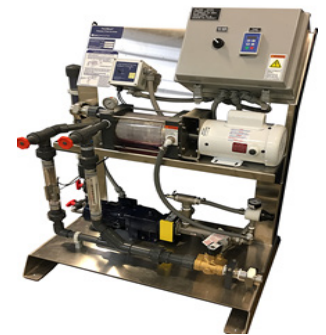
POLYPRO Feed Equipment

During its 100-year history Carus' ongoing emphasis on research and development, technical support, and customer service has enabled the company to become the world leader in permanganate, manganese, oxidation, and base-metal catalyst technologies.