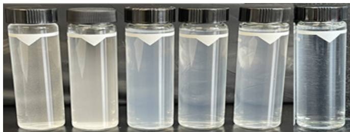
CARUSQUEST® 501 Scale Inhibition