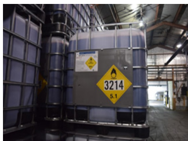
CARUSOL® Liquid Permanganate